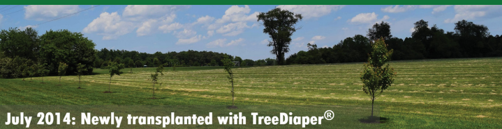
July 2014: Newly transplanted with TreeDiaper® Systems installed