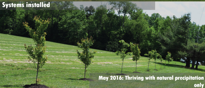
May 2016: Thriving with natural precipitation only

“We’re seeing better root development and overall tree health in our parks”