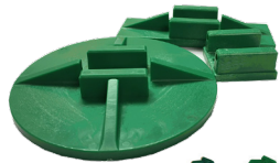
Compatible with Ecoduty 4" and 6" Stakes and Staple Ease Bio Pro Driver