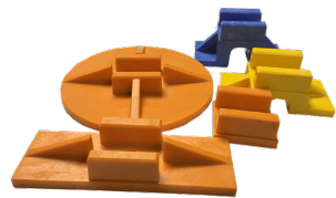
For use with 11-gauge u-shaped steel staples

Irrigation Attachment (Blue) - Installs staples over 1/2" to 3/4" Drip Line - SEF-IRRI-1